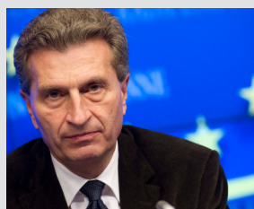
Gunther Oettinger Former European Commissioner for Digital Economy & Society