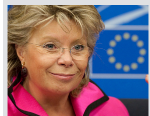
Viviane Reding Former Vice-president for Justice, Fundamental rights and Citizenship