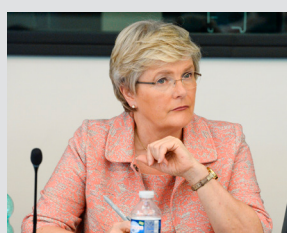
Lieve Wierinck MEP Member of the European Parliament