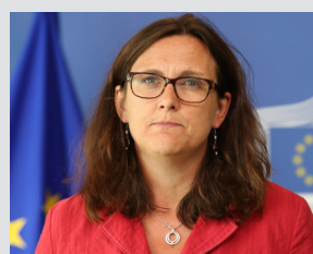
Cecilia Malmström European Commissioner for Trade