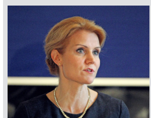
Helle Thorning-Schmidt Former Danish Prime Minister