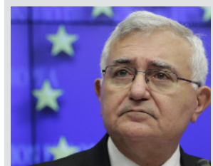
John Dalli Former European Commissioner for Health and Consumer Policy