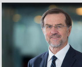
Alojz Peterle MEP President, MEPs Against Cancer, European Parliament