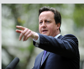
David Cameron Former UK Prime Minister